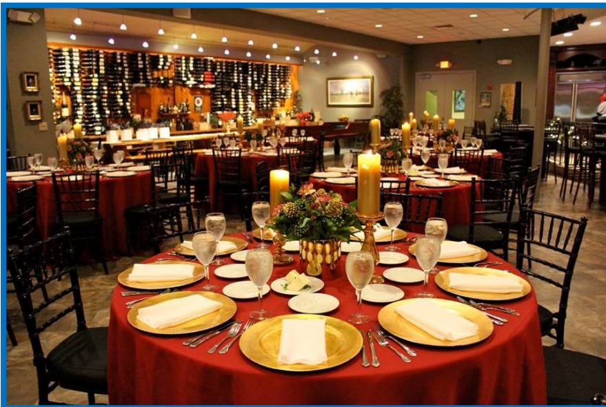
Hugh's Catering photos