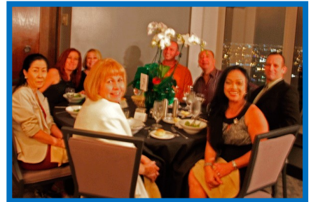
FLOS Holiday Party 2016