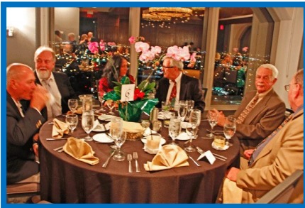
FLOS Holiday Party 2016

There is ample parking on Hugh's property.