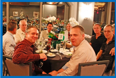
FLOS Holiday Party 2016