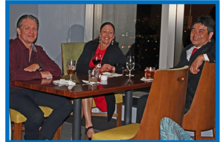
FLOS Holiday Party 2016