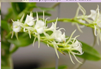
Oeoniella polystachys