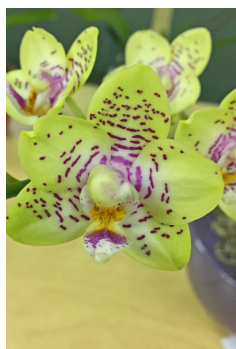
Phal. (Gi Shian x Brother Sara Gold) x Black Eagle Carole Schwimmer