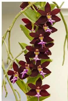
Trichoglottis brachiata - Omar Gonzalez