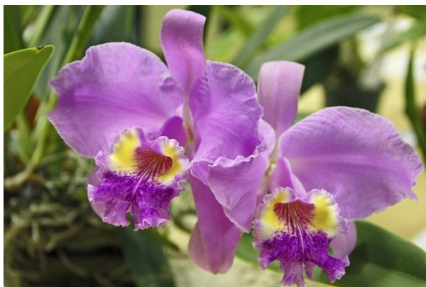
C. lueddemanniana