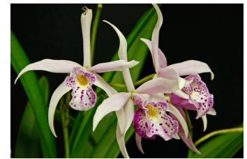
Bc. Sunset Glory Rich Ackerman