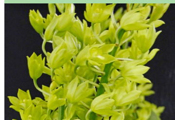
Gram. scriptum f. citrinum Bob Stroozas