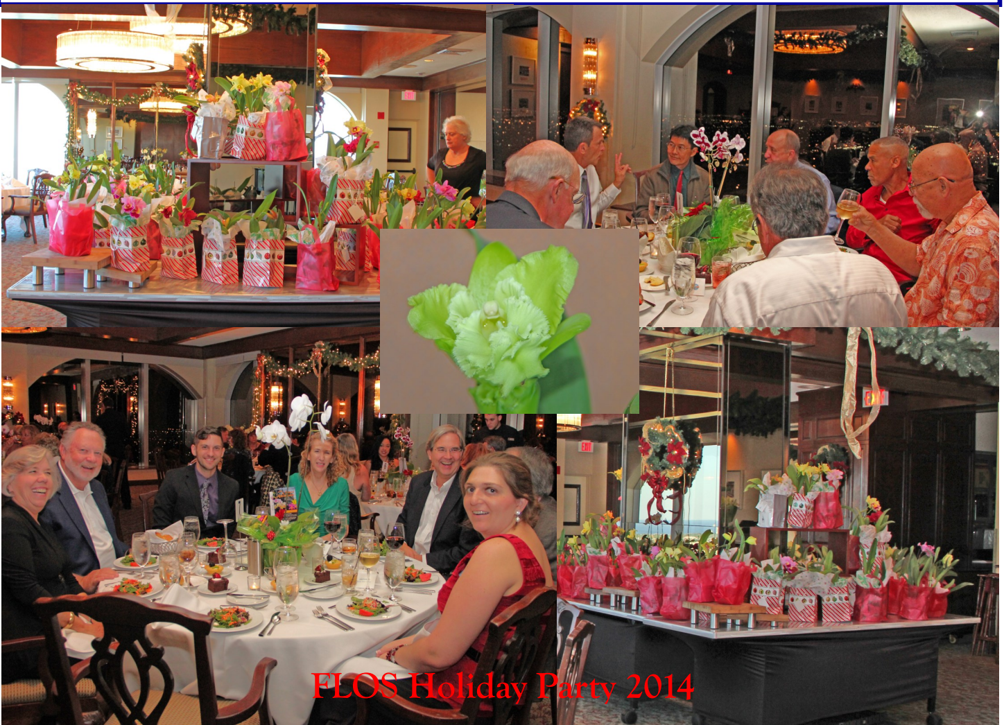
FLOS Holiday Party 2014

The Tower Club phone will be manned the night of the party if anyone needs help: 954-764-8550