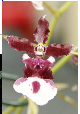
Oncidium Heaven Scent 'Sweet Baby' - Oliver Turnia