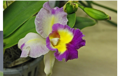
Blc. Redland Rainbow 'Crown Fox' - Norma Jeanne Flack