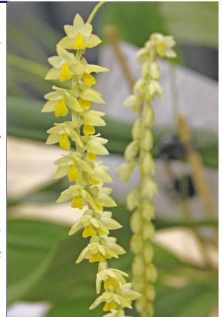
Dendrochilum cobbianum -Chris Crepage

Epidendrums can have few to many inflorescences depending on the plant. They can be miniatures or very large, up to 6’ - so they are very diverse. Radicans are Epidendrums that are considered a “weed” in our growing environment. Epidendrums can be a little particular about root disturbance - they prefer growing undisturbed. Epidendrums prefer to be well drained and rather dry, so mounting or in wire baskets with no medium is best however they do very well when mounted. There is also a tendency to rot easily if the plants stay too wet or if there is not enough air movement. Once you have that mastered, these plants grow very well here.