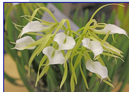
B. Nodosa