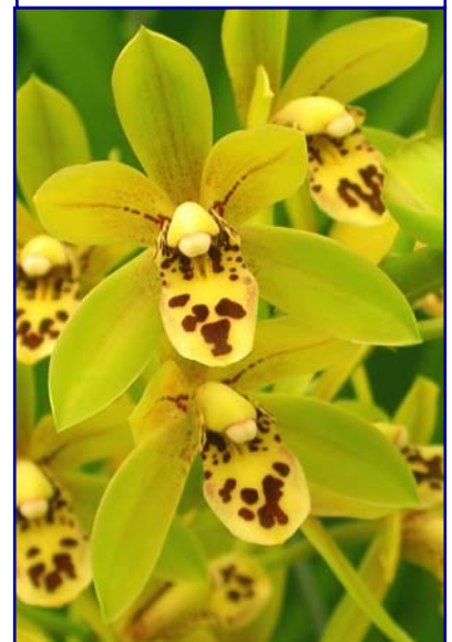
Cym. Giselle 'Ballerina'