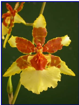
Cym. (Green Pastures x Applejack 4n) 'Shapely' by Milton Carpenter

Remember we will be getting plants from vendors but we also need your participation