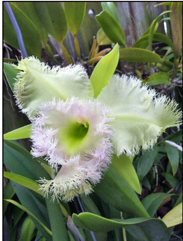
Rlc. Golf Green 'Hairy Pig' (digbyana) grower Ken Slump

Please be sure to PRINT on the ribbon judging sheets. Our cursive may be attractive but it is difficult to read!