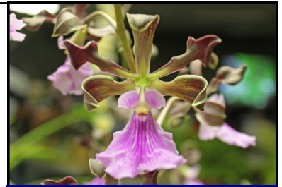
Max. tenuifolia—Garfield Gilchrest