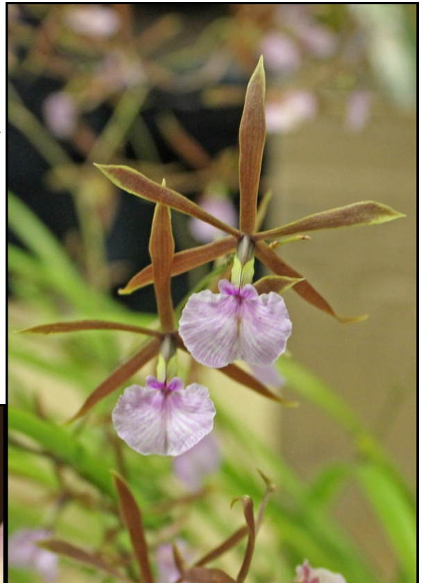
Enc. Bractescens—Rich Ackerman