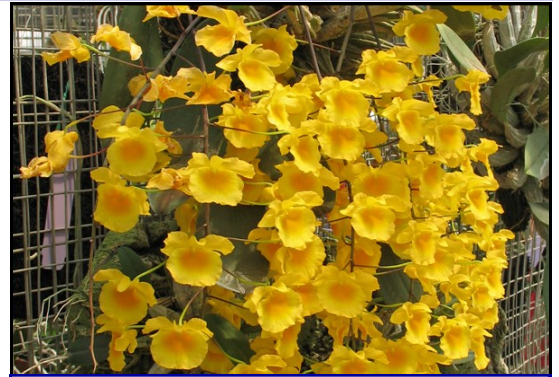
Ramble