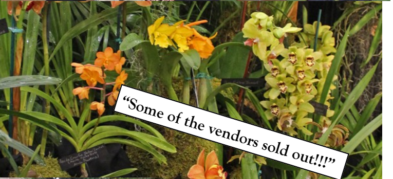
"Some of the vendors sold out!!!"