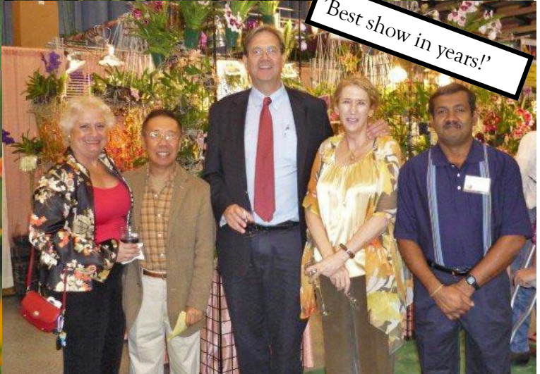
'Best show in years!'