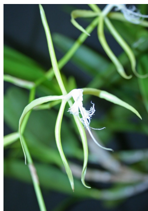
Epi. ciliare (species) - Bob Isaacs