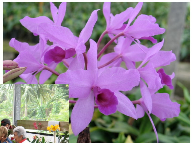
C. deckeri at Quest