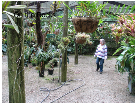
On the Rocks