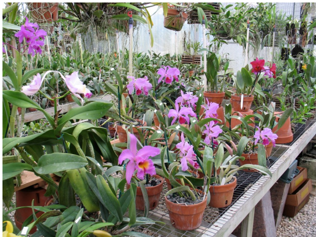
Henington Farms orchids