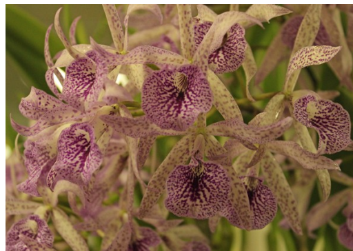
Bc. Maikai - Tin Ly